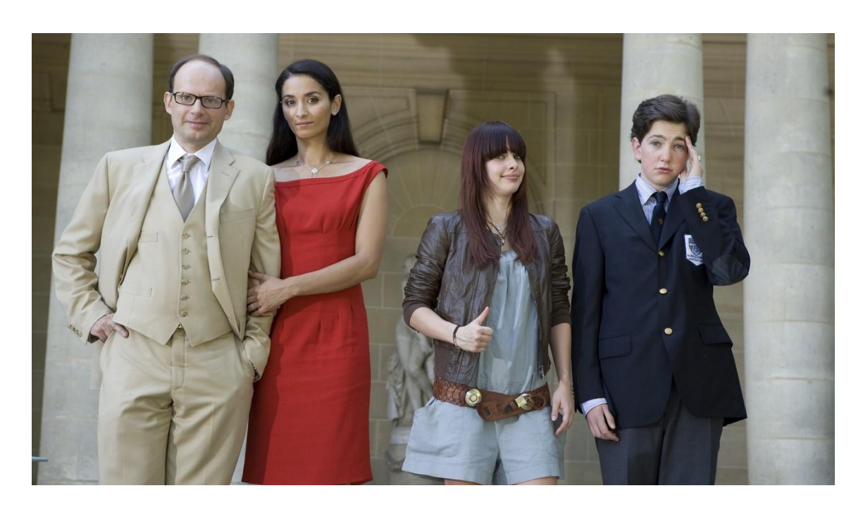
The wealthy familly De Chazelle waiting for Sami